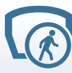
OPTIONAL Hose reel