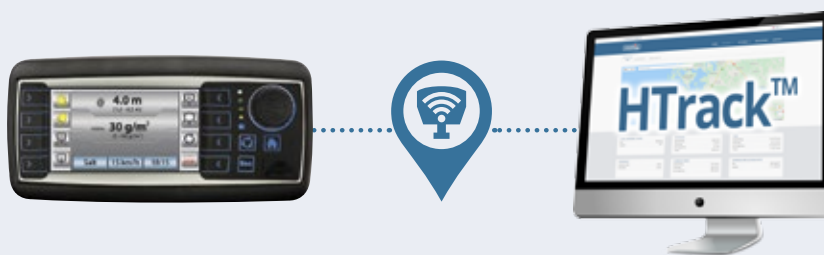
The optional HTrack™ program transfers spreading data via mobile network

Track and manage all of your spreading devices and snowplows online on your computer, tablet or smartphone. The program shows treatment route on map, and spreading details like speed, GPS location, material used etc. With HTrack™ you can keep track of your expenses and get de-icing performance evidence for slip and fall injury claims. The spreading data can be summarized and generated as PDF reports.