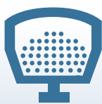
STANDARD Salt & sand

The hopper construction can easily be transformed into a complete brine solution sprayer or into a pre-wet combi spreader that moistens the spreading material. Integrated tanks in the double-walled hopper body holds up to 450 l of liquid. The spreader can optionally be equipped with a 2 meter spray bar or a hose reel with hand-held spray nozzle.