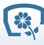
OPTIONAL Summer/garden use