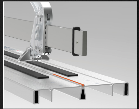
STRUCTURE Strong body made in aluminium draw-plate to get rigidity and lightness at the same time.