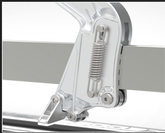
QUICK START SYSTEM The carriage is provided with springs that makes the handle always ready to cut.