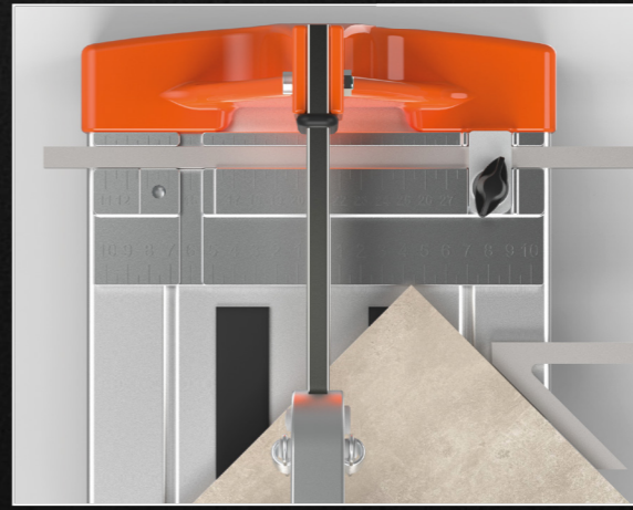
DIAGONAL CUTS Square ruler with direct reading for diagonal cuts .