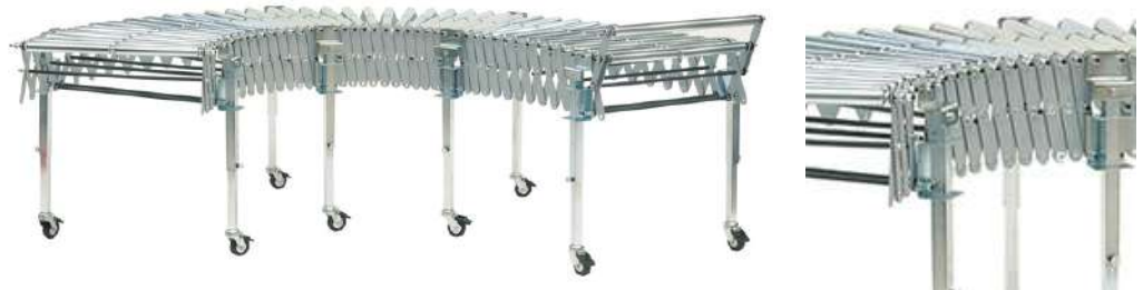
GTR - FLEXIBLE METALLIC ROLLER CONVEYOR