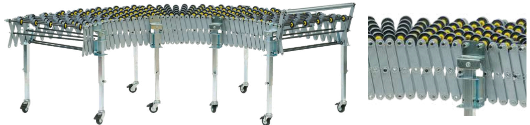
GTL - FLEXIBLE PLASTIC WHEEL CONVEYOR

Flexible conveyors offer a versatile and cost-effective solution for moving products, providing maximum flexibility in terms of length, height, and bending radius. These conveyors are commonly used in packaging lines and at the end of production lines to create box accumulation. Plastic wheels are suggested in case of very low box weight.